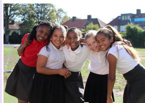
Photographs of play time all taken by the children